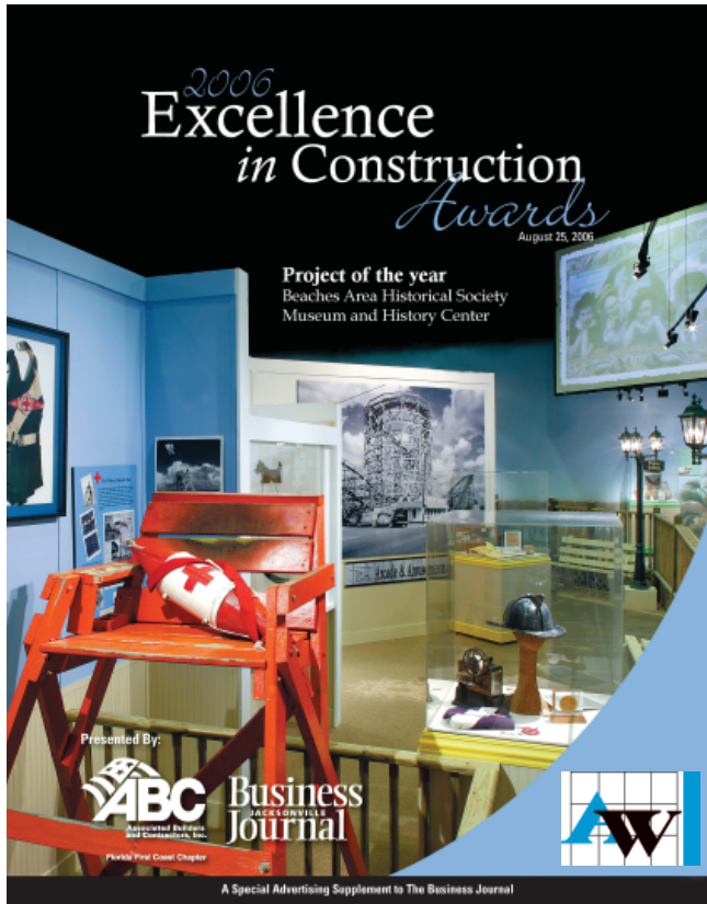
Cover of the Associated Builders & Contractors 2006 Awards Gala Supplement featuring the BAHS "Boardwalk".