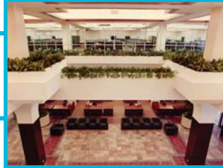
JEA Customer Service Center Renovation, 1st Project for JEA