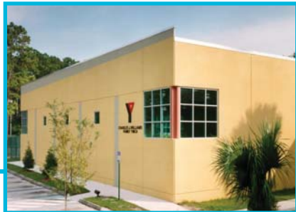
Williams Family YMCA, 1st Project for YMCA