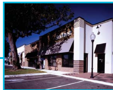
SunTrust Branch Bank in Riverside, 1st Project for SunTrust