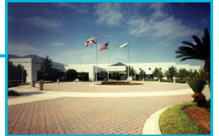
Vistakon Deerwood Expansion