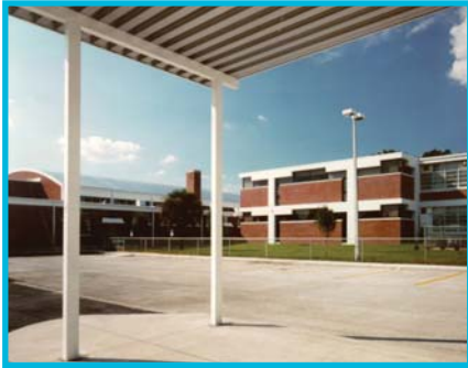
James Weldon Johnson Renovation, 1st Project for Duval County Public Schools

Office moves from East Adams to 5730 Bowden Road