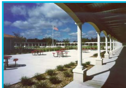
Bishop Snyder High School