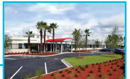
CitiGroup Family Center, 1st Project for CitiGroup