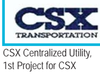
CSX Centralized Utility, 1st Project for CSX