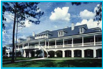
Jacksonville Golf & Country Club, 1st Clubhouse Project

Name changes to Auld & White Constructors, Inc