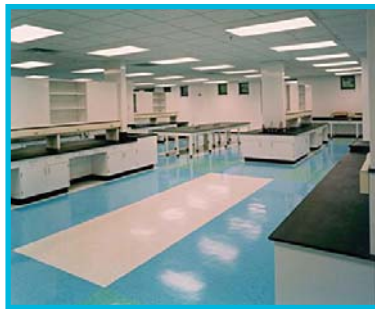
Florida Department of Health, Central Lab Addition & Renovation, 1st Project for FDOH

Office moves from Bowden Road to 4168 Southpoint Parkway