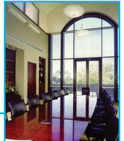
Community 1st Credit Union Headquarters, 1st Project for Community 1st Credit Union