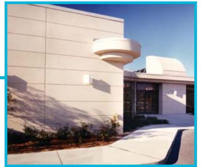
Baptist Edgewood, 1st Project for Baptist

Office moves from Bowden Road to 4168 Southpoint Parkway