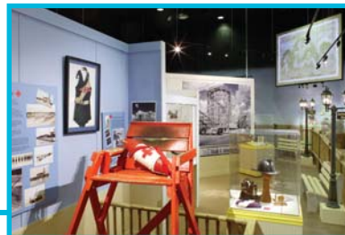
Beaches Area Historical Society Museum & History Center Wins AWC's First Project of the Year Award and National Award of Excellence from Associated Builders & Contractors (ABC)