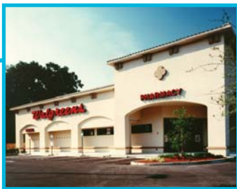
Walgreens, Lem Turner Road, 1st Project for Walgreens