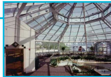
Riverplace Tower Renovation, 1st Project for Gate Petroleum