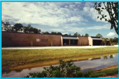
State Farm Service Center, 1st State Farm Project