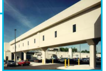
Vistakon Injection Molding Renovation, 1st Project for Vistakon